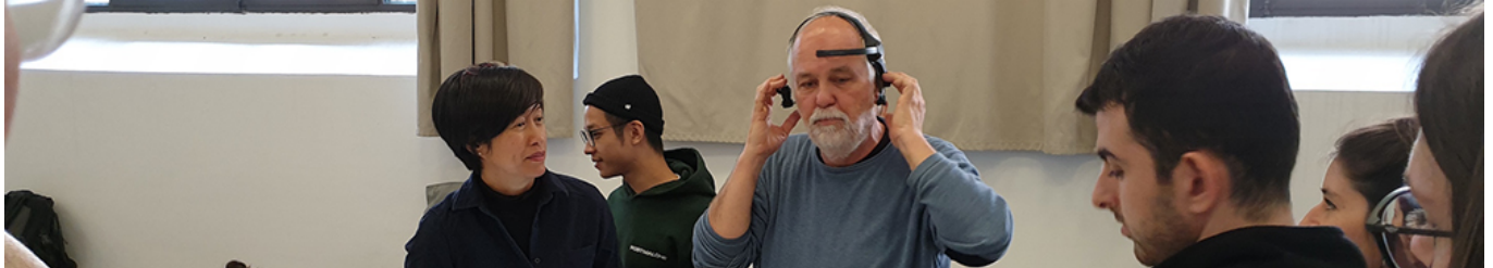
EEG testing, University of Florence, March 2020