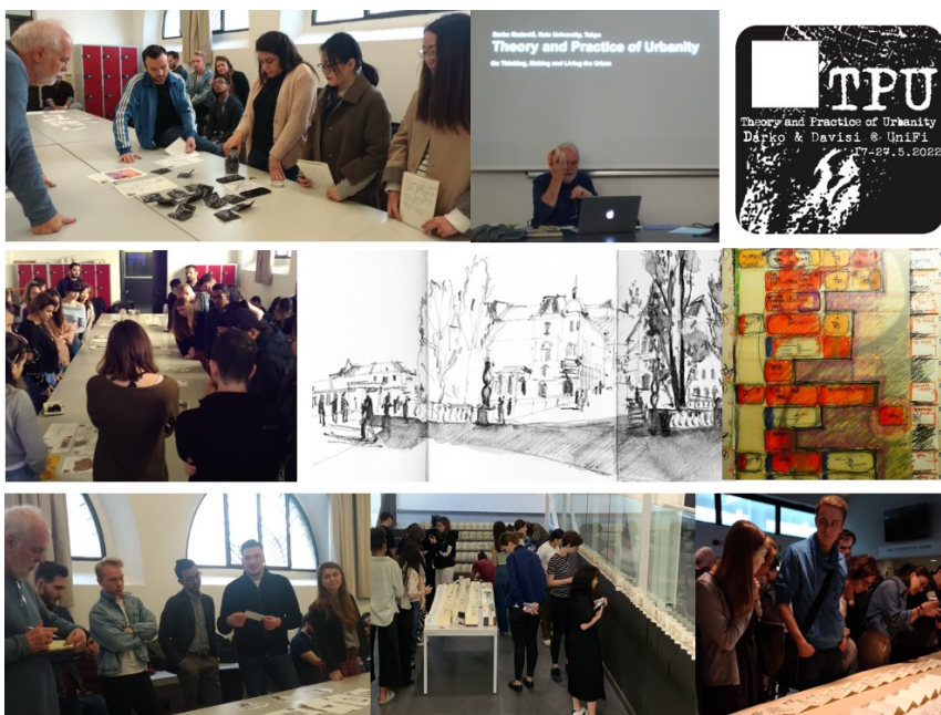
TPU@ POLIMI 2017, @Firenze 2019, 2022

In TPU, students are partners in critical thinking and making of the urban . Ideally, TPU numbers are limited (to 8-24 students).