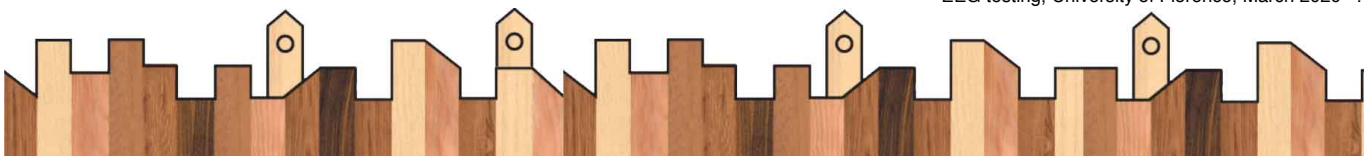
representation of the urban (one of the examples)