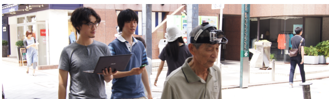
fieldwork Jiyugaoka, Tokyo June 2015