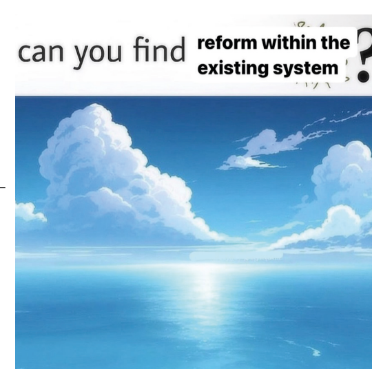
Slika 1: Having trouble! 1

UL FA, EMS Arhitektura, Ljubljana, Magistrsko delo, 2025 50