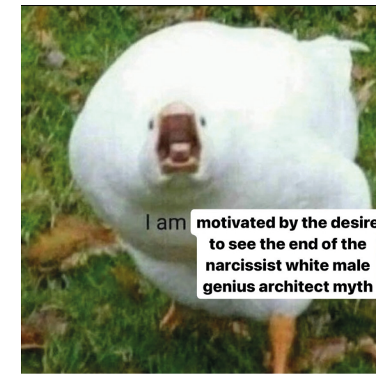
Slika 10: Afirmacija 10-krat 164

ecologisation of architecture, transdisciplinarity, process philosophy, folding, becoming, posthumanism, transformative practice, performative practice