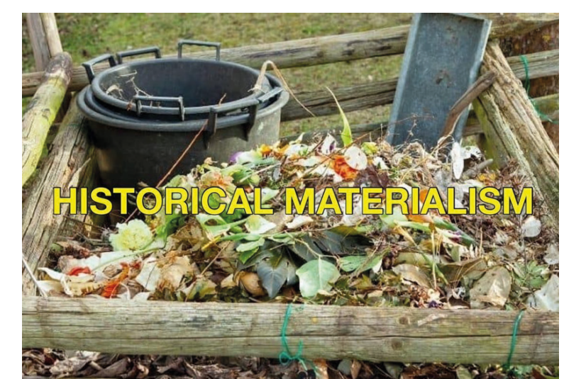
Slika 4: Brez naslova 58

UL FA, EMS Arhitektura, Ljubljana, Magistrsko delo, 2025 110